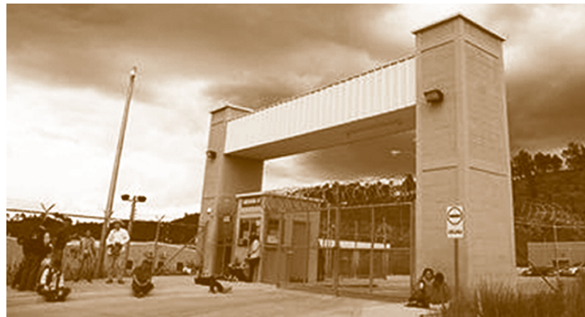
Waiting at entrance to La Tolva military prison, May 24, 2018.