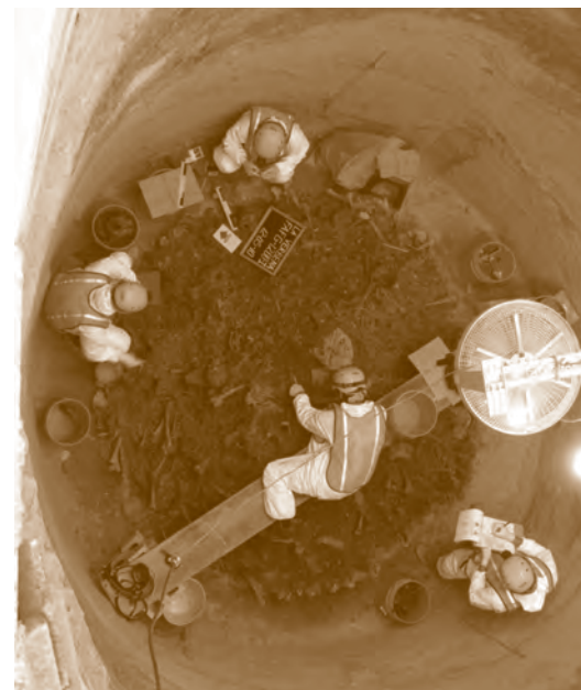
In the La Verbena cemetery, Guatemala City zone 7, a Rights Action/ UNBC (University of Northern British Colombia) delegation spent a day, in May 2010, with the FAFG, as they were exhuming the remains of thousands of bodies from this vast mass grave. Based on what they exhume here, on testimonies and on DNA samples from surviving family members of the “disappeared”, the FAFG is fairly certain they will positively locate the remains of some of the “disappeared”, and be able to return their remains to their loved ones.

Since late 2009, a tiny crack has opened in the wall of impunity. Human rights and surviving-victim groups are again trying to push their cases forward. In this Program Area, in 2010 alone, we have channeled more than $35,000 to groups seeking truth and justice.