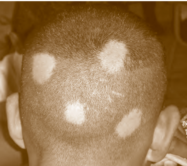
Serious health harms – including skin diseases, hair loss, etc – continue to affect poor campesino and indigenous communities near to Goldcorp’s open pit, cyanide leaching mines in Honduras and Guatemala. This boy lives right near Goldcorp’s “San Martin” mine in Honduras.