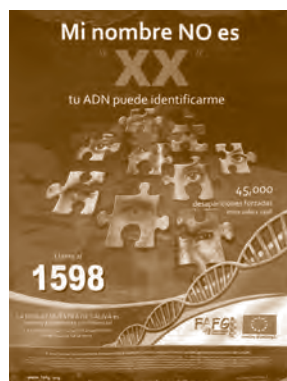
The FAFG – Guatemala Foundation of Forensic Anthropology – has initiated a nation wide effort to locate as many of the over 45,000 “disappeared” people as it can. With testimonies, DNA samples and exhumations, they are advancing, very slowly, in this crucial and heart rendering process.

and Honduras; HudBay Mineral’s nickel mining in Guatemala; Pacific Rim’s desire to mine for gold in El Salvador; the World Bank and Inter-American Development Bank’s “Chixoy Dam” project in Guatemala; and more.