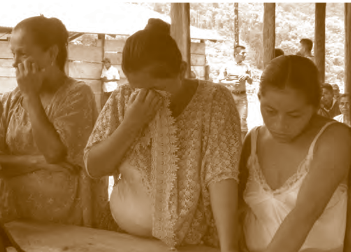
During a May 2010 visit to the remote Mayan Qeqchi village of Lote 8, women villagers told the UNBC and Rights Action delegation of how at least 5 of them – here 3 speak in Qeqchi to our Qeqchi-Spanish translator – were gang raped by CGN security guards and Guatemalan police and soldiers.

As of yet, Goldcorp Inc. has refused to suspend its mining operation. As of yet, the government of Guatemala has not complied with the ruling, let alone its own promise. This extraordinary struggle, on the part of the mining-harmed communities, hangs in the balance. For more information: info@rightsaction.org .