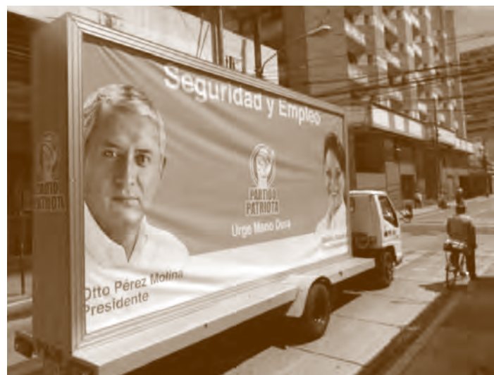
Ex-General Otto Perez Molina, leading presidential candidate for September 2011 elections, alleged author of war crimes in Guatemala, particularly in the 1980s.

WATCH ( http://www.youtube.com/watch?v=gdV1WJJEH&feature=email ) – a Democracy Now interview (in English and Spanish)