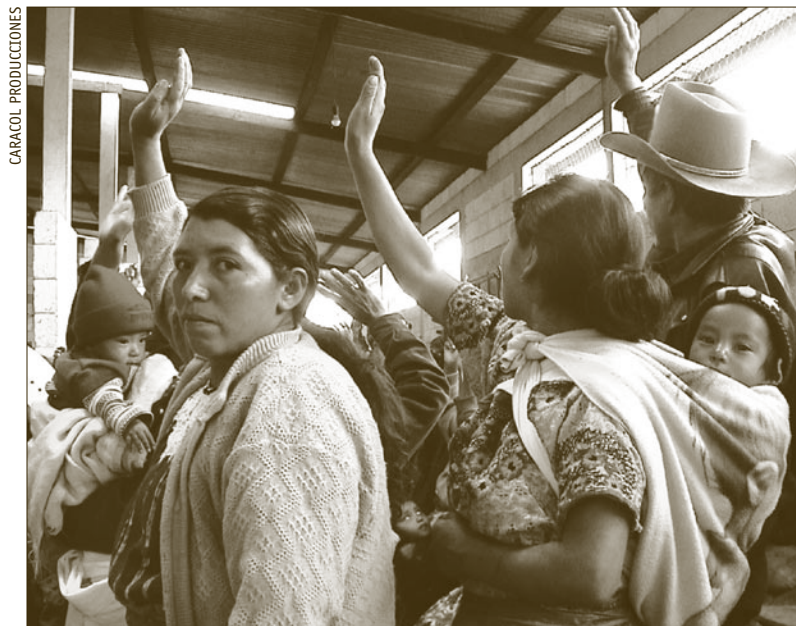
Mayan-Sipakapense women voting in referendum on mining.